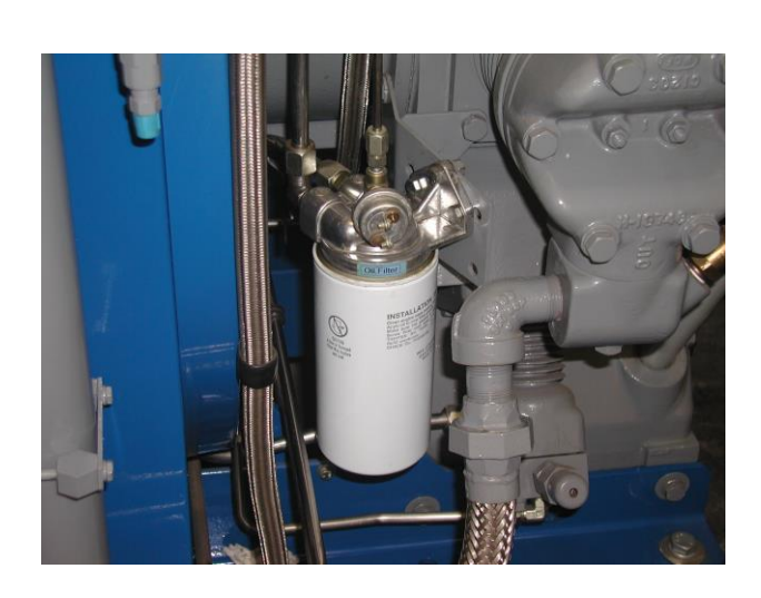
Spin Off Oil Filter