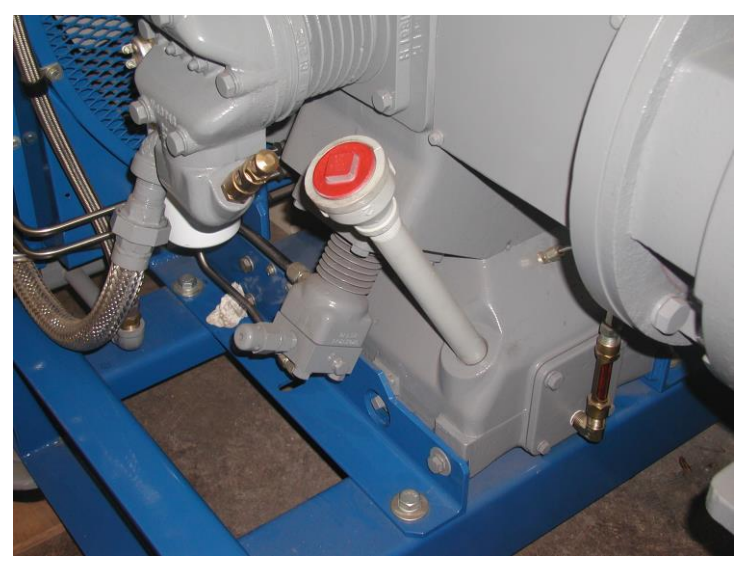
Oil fill extension & bell mouth